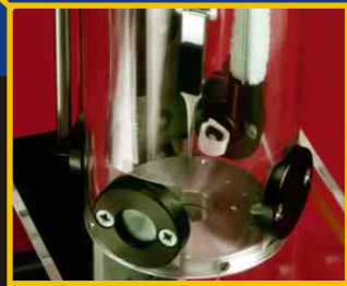
Detail of blotting device