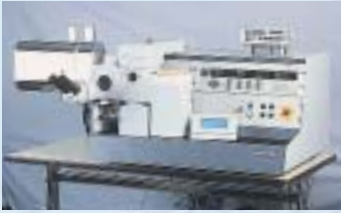
Sample preparation: freeze fracturing and coating in MED 020