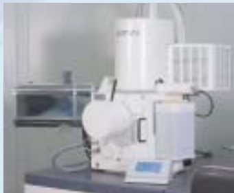
Sample analysis: shuttle is attached to the SEM and the sample is transferred into the SEM cold stage. The shuttle can be removed for analysis.