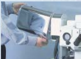
Sample transfer: sample is transferred into the shuttle and transported cold and under high vacuum.