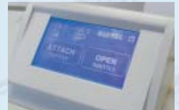
Integrated communication between VCT 100 and SEM.

Touch screen controlled operation of airlock. Pneumatically controlled air lock without magnetic or electrical fields on SEM.